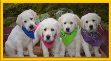
Charm's Last Litter (L to R) Eugene, Etta, Eleanor, Emma

It has been our joy to welcome almost twenty years of CCI puppies into the world and see who they become.